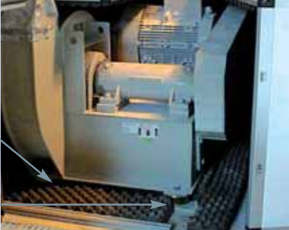
Fan mounting and acoustic enclosure