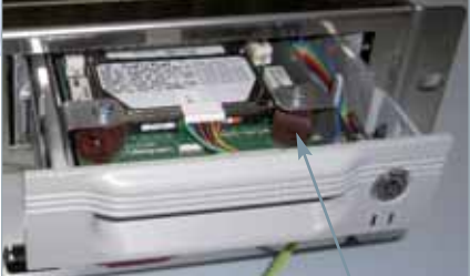
Hard drive mounting system