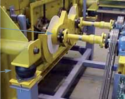
Anti-vibration mounts and flexible couplings on a hopper