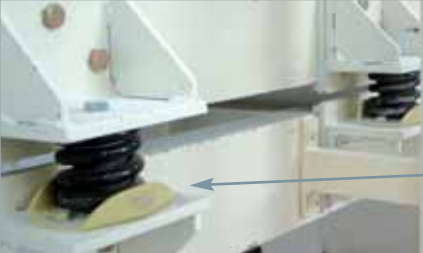
Mixer mounting system