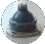
Display Mounting System